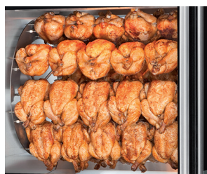
Large product view