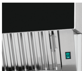
Ventless hood (optional)